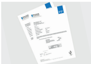
Performance Guaranteed Each filter is hydrostatically tested prior to despatch