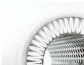
NEW Filtration Technology

Low cost connecting kits and new filter head design enables easy close coupling assembly