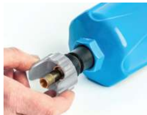
Externally Accessible Drain

Alpha deep pleated media technology delivers a step change in performance