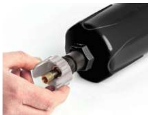
Externally Accessible Drain Valve

Removes 99% of bulk water even at low velocities