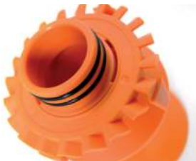
Unique Centrifugal Module

Removes 99% of bulk water even at low velocities