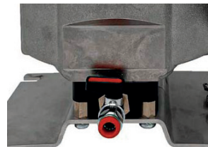
Simple Servicing External ball valve allows for manual condensate discharge and testing