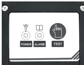
User-Friendly Control Panel with LED lights and test button indicate device status