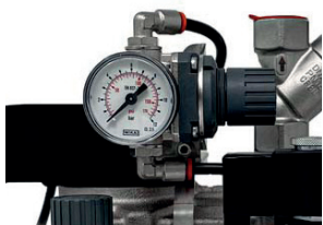
Visible Performance Easy-to-read gauges identify pressure levels within the device