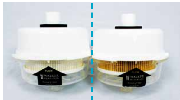
Primary Filter as new

High efficiency filtration is the key to successful plume removal.