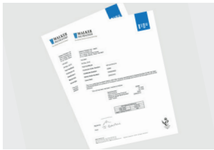
Performance Guaranteed Each filter is hydrostatically tested prior to despatch