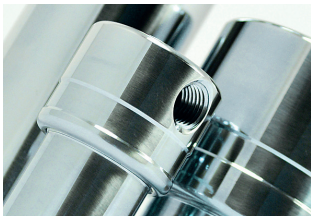
Comprehensive Range 725, 1450 and 5000 psig (50, 100 and 350 barg) models available

Available in four filtration grades from 5 to 0.01 Micron and Activated Carbon, our stainless steel high pressure range guarantees maximum contaminant removal and offers varied flow rate capacities of 725, 1450 and 5000 psig (50, 100 and 350 barg).