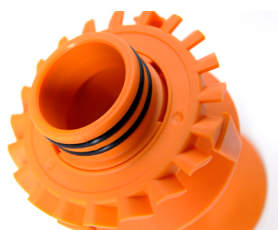
Unique Centrifugal Module

No replacement components are required, making Walker Filtration's Water Separators a viable and cost effective solution for removing bulk water from compressed air.