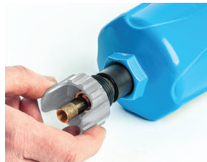
Externally Accessible Drain

Alpha deep pleated media technology delivers a step change in performance