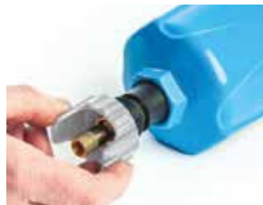
Externally Accessible Drain

Alpha deep pleated media technology delivers a step change in performance