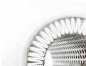
NEW Filtration Technology

Low cost connecting kits and new filter head design enables easy close coupling assembly