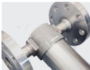
Flexible Installation Flanged High Pressure Filters and Water Separators available upon request