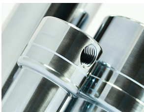
Comprehensive Range 50, 100 and 350 barg (725, 1450 and 5000 psig) models available

This range of housings can also be adapted to operate as Water Separators or provide flanged connections.