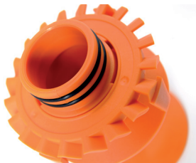
Unique Centrifugal Module

No replacement components are required, making Walker Filtration's Water Separators a viable and cost effective solution for removing bulk water from compressed air.