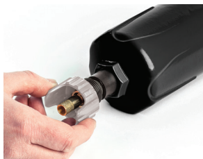
Externally Accessible Drain Valve

Removes 99% of bulk water even at low velocities