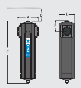
Model XF200WS - XF300WS