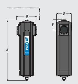
Model XF200WS - XF300WS